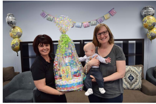
Community Baby Shower