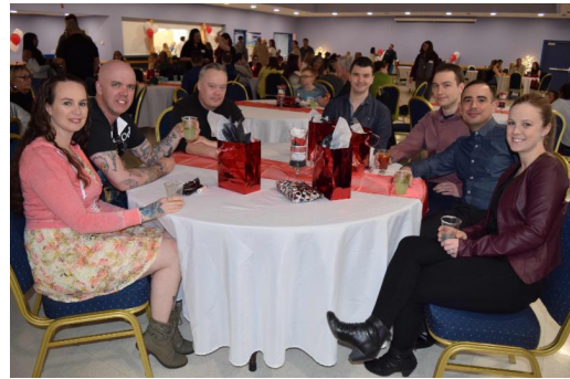
Volunteer Appreciation Dinner