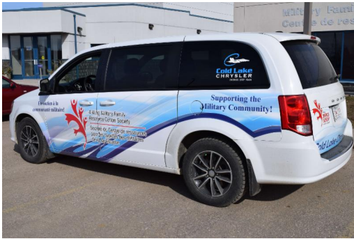
New MFRCS Van from Cold Lake Chrysler