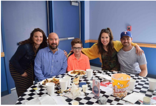
Father's Day Lunch